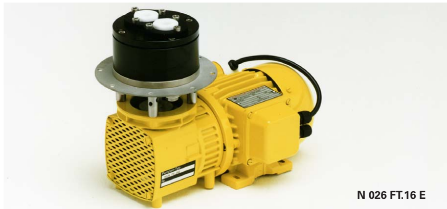
N 026 FT.16 E